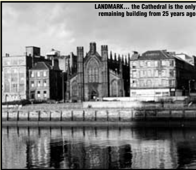
LANDMARK... the Cathedral is the only remaining building from 25 years ago

If the plans are given the green light, it could take up to three years to complete the development.