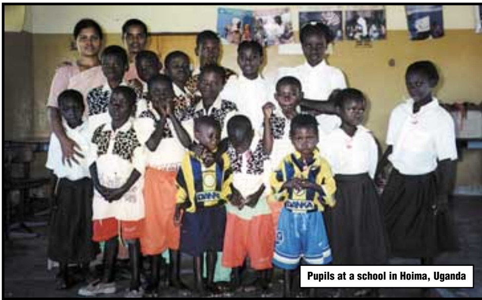
Pupils at a school in Hoima, Uganda