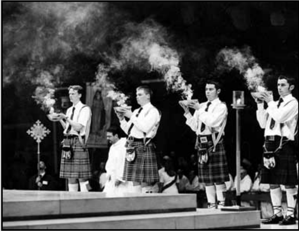
Young Scots ready to serve at the annual Archdiocesan Pilgrimage to Lourdes

The end of something is always hard to take, and the end of being