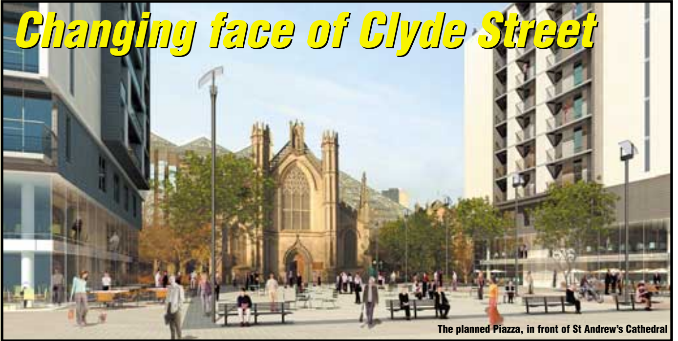
The planned Piazza, in front of St Andrew's Cathedral

AMBITIOUS PLANS to develop the land opposite St Andrew's Cathedral on Clyde Street have won the backing of the Archdiocese of Glasgow.