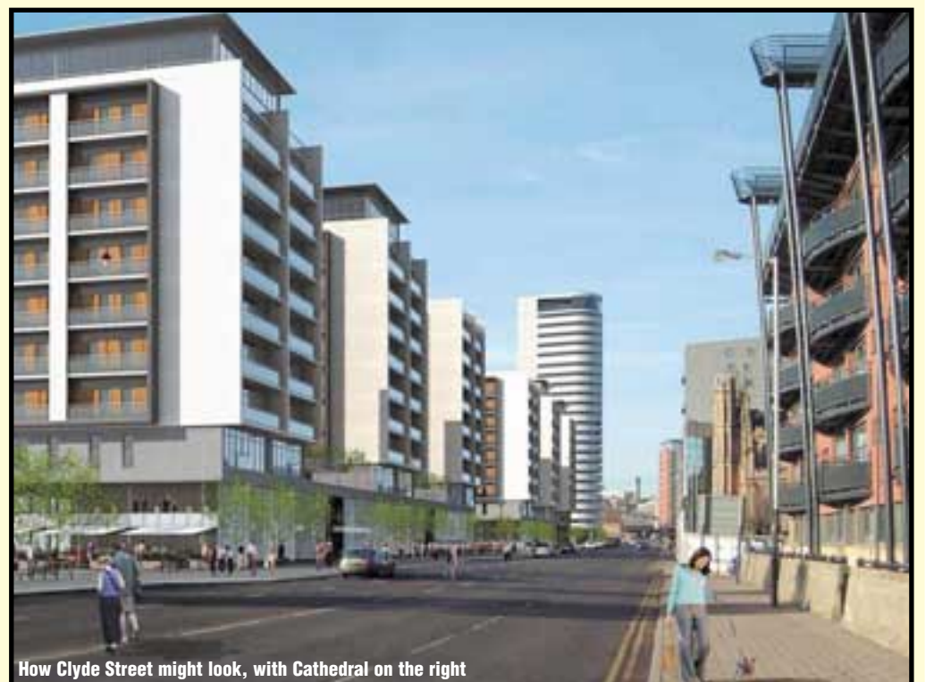
How Clyde Street might look, with Cathedral on the right

Telephone Aileen Kirk on 0141 429 3700 251 Paisley Road, Glasgow G5 8RA